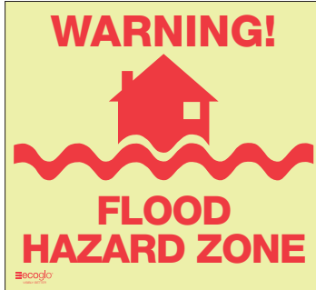
315mm x 290mm

Signs are available in 3 sizes as shown here. See the full range of signs with product codes on the next page.