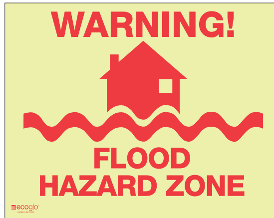
600mm x 475mm