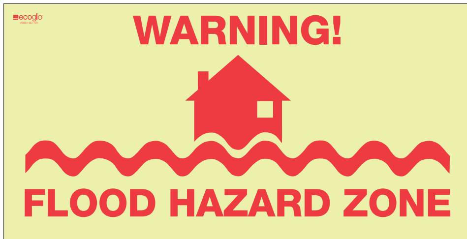
945mm x 580mm

Ecoglo S20 HTC Disaster Preparedness Signs are designed to be used to either warn of natural hazards or direct persons to safety when a natural hazard occurs. The signs will be clearly visible and readily understandable under all conditions of foreseeable use, including darkness.